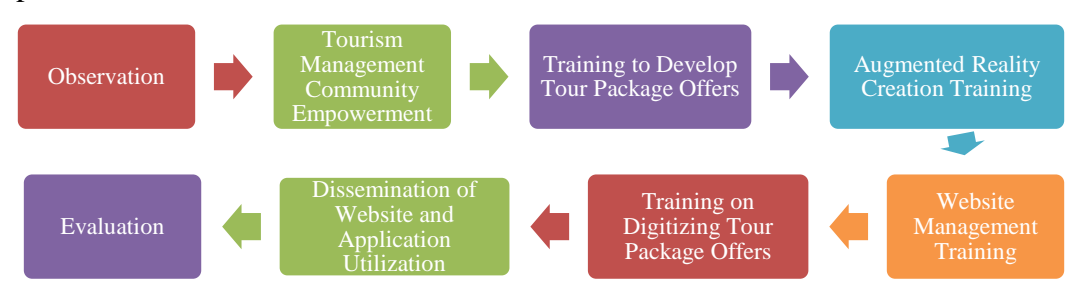
Figure 1. Nateh Village Tourism Promotion Digitization Method Design

The training activity was carried out from 5 to 13 March 2022, the location of the training was at the Qianna Inn Barabai Hotel, Hulu Sungai Tengah Regency, South Kalimantan Province. The design method implemented is as follows: